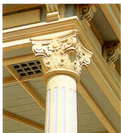
Capitals on the second-floor balcony

The style is quasi-Renaissance but not of authentic kind. The structural symmetry and the carving of the ornamented capitals may convey hints of the Western style.